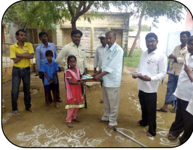
SCHOOL MATERIAL DISTRIBUTION