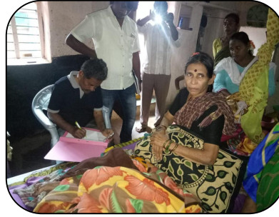
SCI Home Based Visit with senior technician from