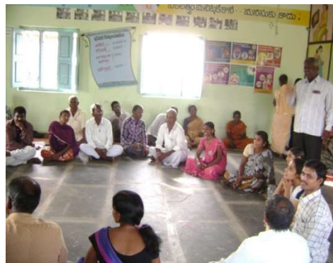
Aadarsha Regional Action Committee, Kurnool District