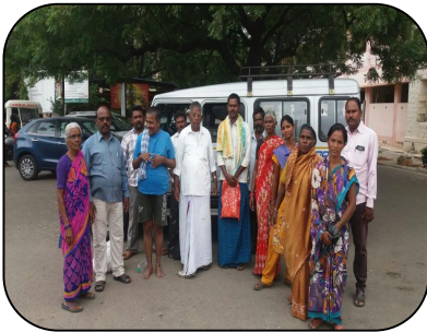
CMH follow up in Anantapuram Government Hospital