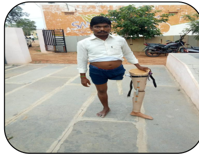
AIDS & Appliances