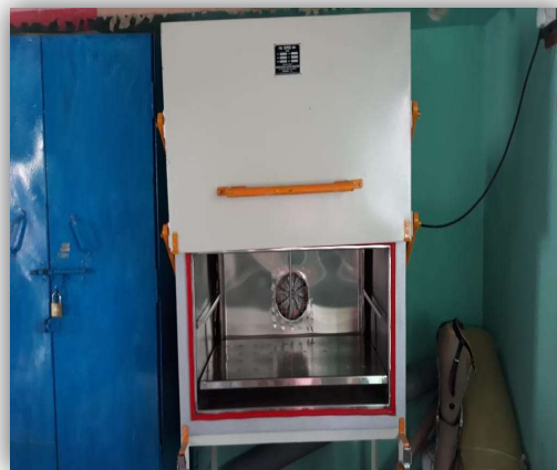
THE NEW OVEN