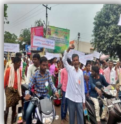
CELEBRATION OF INTERNATIONAL DISABLED DAY