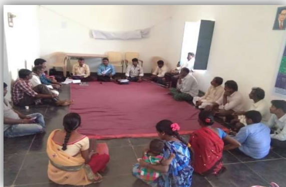
General Body Meeting