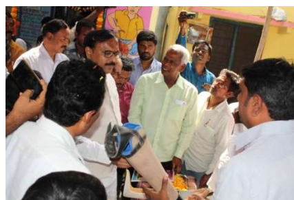
LLC Office Inauguration by MP Sanjeev Kumar,KURNOOL District

SACRED will play major role to access services for the Kurnool total District. At present half of the district covered by SACRED CBR programs. Next half of the district only with National Trust Act New Delhi schemes. It is an added responsibility to SACRED continue journey to work with total community and the total Kurnool District.