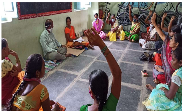
Vennela Women with disability Federation

SACRED moving towards inclusive approach further strengthening and sustain in the community. It was amazing journey of 25 Years to bring the changes and its outcomes shown through data base tables stated here under.