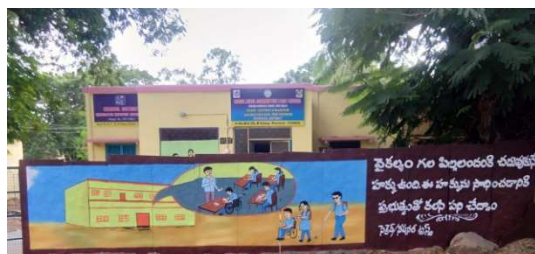
Local Level Committee Office(LLC),KURNOOL District

SACRED has a good network to built the relationship with Government Departments.